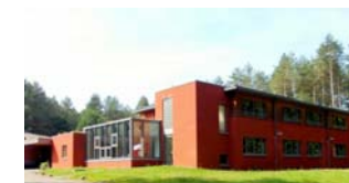
"Huize Lieve Moenssens"

The "Huize Lieve Moenssens" rest home is located in Dilsen-Stokkem (a few kilometres of Maasmechelen Village) near to a residential district. The land on which the rest home is situated is owned by the commune but is subject to a long lease set in 1981 for a period of 99 years. The building was initially built in 1986 as a center for people with disabilities, then transformed to a rest home in two separate phases in 2002 and 2004. In 2007 a new wing was added to increase the capacity to its current 67 beds. The rest home is operated by the Soprim@ group under a 27-year triple net long lease. The contractual value amounts to approximately €5 million 10 and generates an initial triple net yield of approx. 6.5%. In addition, the site offers significant potential for future expansion.