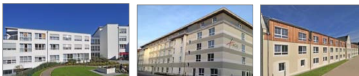
« Herkenrath »

Bavaria (one of most important rehabilitation clinics in the country). Built in 2011, it contains 84 beds in 77 rooms.