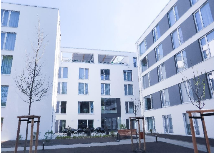
Haus Steinbachhof – Chemnitz

Aedifica signed an agreement for the acquisition of a fully operational rest home in Chemnitz.