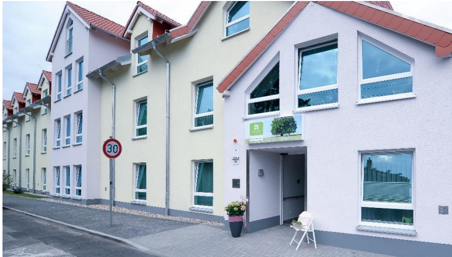
Seniorenhaus Wiederitzsch – Leipzig

Aedifica signed an agreement for the acquisition of a fully operational rest home in Leipzig.